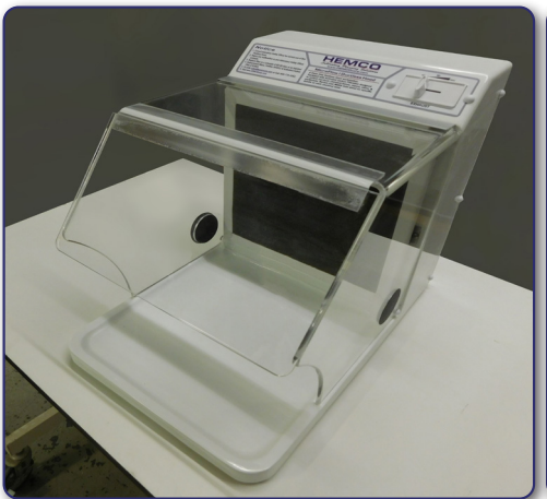
Micro Flow I Dimensions 12" wide X 18" deep X 14.5" high