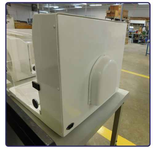
Micro Flow I Rear view