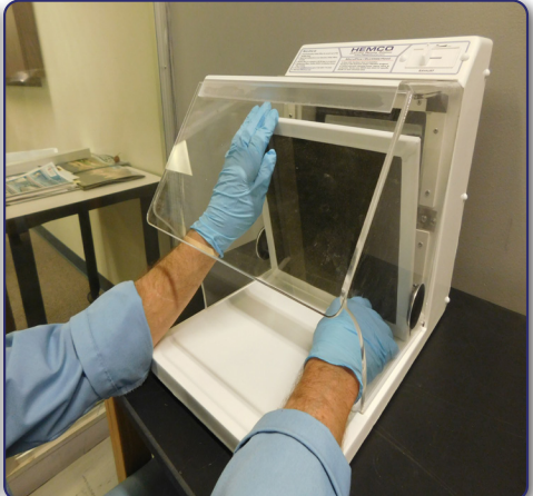
Easy replacement of pre-filter on Micro Flow I